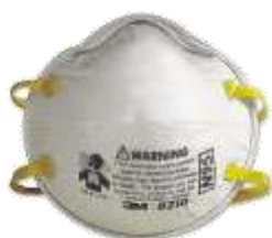
N95 Face Mask

The donning and doffing of PPE will be supervised by a volunteer trained in using PPE